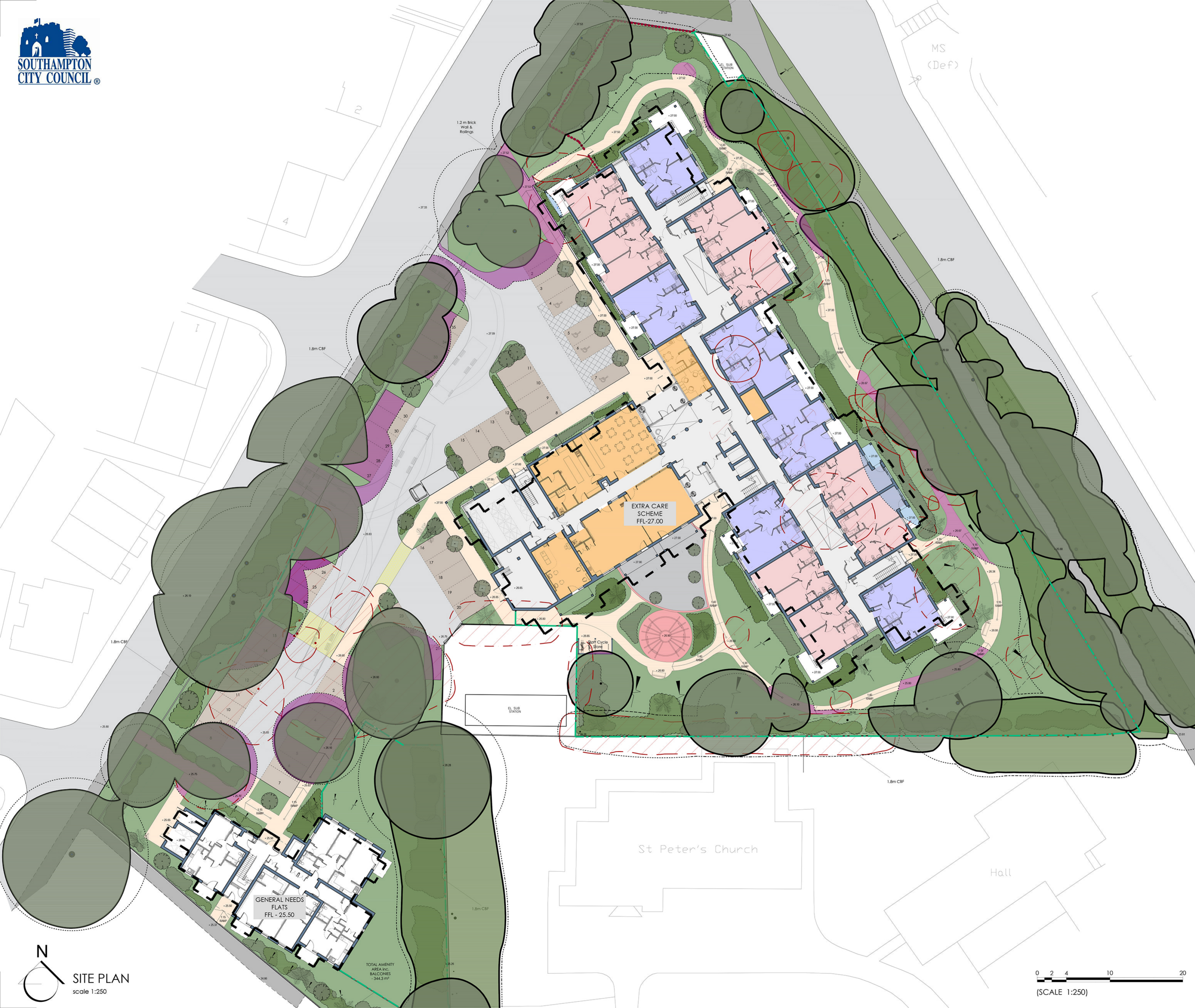
SITE PLAN scale 1:250